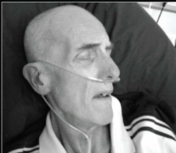
Photo by kind permission of the family of George Cahill who died from mesothelioma

The Government says defendants bear too much of the risk of litigation and mesothelioma sufferers must now bear their share of the risks by paying up to 25% of their damages for pain and suffering in legal costs.