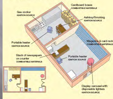
Before a fire-risk assessment